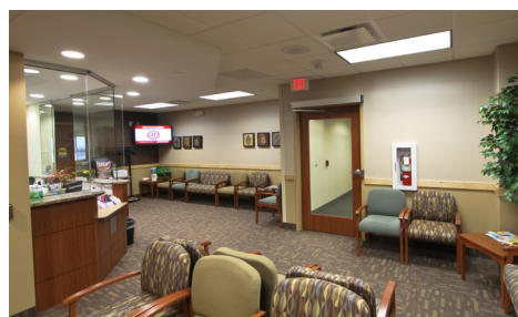
Lakeview Family Practice